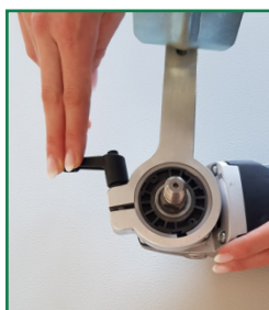
Clamp the lever