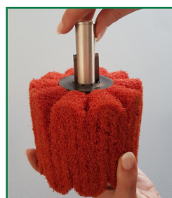
Stick satin finishing mandrel in roller