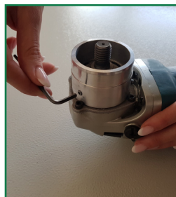
Bosch / Maktita / Metabo / Milwaukee