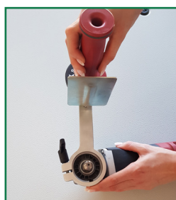
Put on the base body