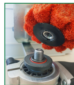
Mount the mandrel on the lower flange of the angle grinder