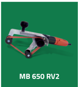
MB 650 RV2