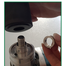
Attention: remove the spacer ring for models Bosch, Makita, Metabo and Milwaukee