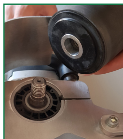
Put on the drive wheel