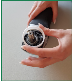
Flex / Fein