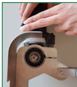
Clamp the lever