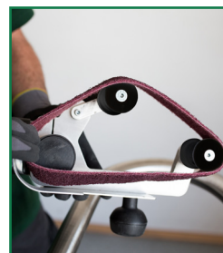
Mount grinding belt