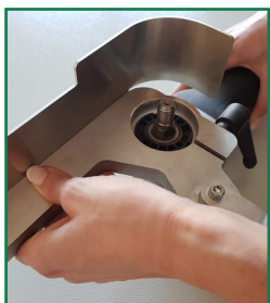
Put on the base body